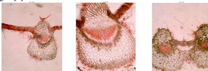
Figure No: 02 Microscopy of Abutilon Pannosum

and abaxial spongy mesophyll tissue (dorsiventral leaves). The palisade mesophyll is made up of two rows of narrow, cylindrical cells. The spongy parenchyma is made up of 5 layers of loosely packed cells. In the region of the lateral vein, the lamina thickens slightly. The lateral veins' circulatory bundles are made up of phloem, xylem, and a parenchymatous bundle sheath. The midrib region is extremely visible on both the adaxial and abaxial sides. All sides of the midrib have dense trichomes. The ground tissue is made up of 4 - 5 layers of collenchyma cells from the abaxial midrib. The remaining ground tissue is made up of ground parenchymatous cells. The huge and arch-shaped vascular bundle. Xylem is made up of multiple radial rows of cells. The phloem is situated in the xylem and covers a huge area in comparison to the phloem seen in many dicotyledonous leaves. It was discovered that the architecture of the leaves in the apex, middle, and bases are comparable. The trichomes are significantly denser in the intermediate region, then in the upper and finally in the lower region. Because of the palmately venation of the leaf at the base of the leaf, two mid regions occur in Abutilon figarianum . Many calcium oxalate druses have developed in some parenchyma cells of the mid rib region, and these are numerous in the basal region[4].