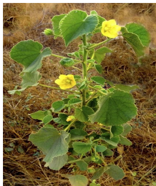
Figure No: 01 Abutilon Pannosum Plant

Abutilon Pannosum is under tomentose shrub widely distributed in India, North Africa, Asia, and Australia, and bears spherical fruits with about 25 carpels, each of which covers hairy plant widely distributed from tropical Africa to Australia through Asia. It grows a height of 2 m and bears small, ovoid fruits with tasteless seeds. Its leaves have antibacterial, antioxidant, and antifungal properties.