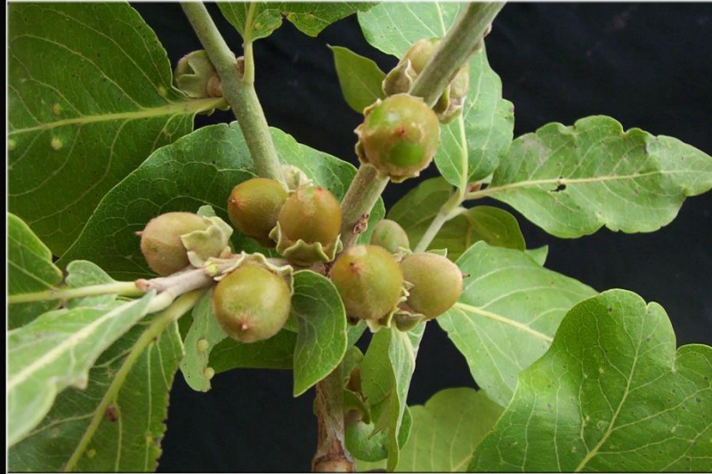
A flowering twig