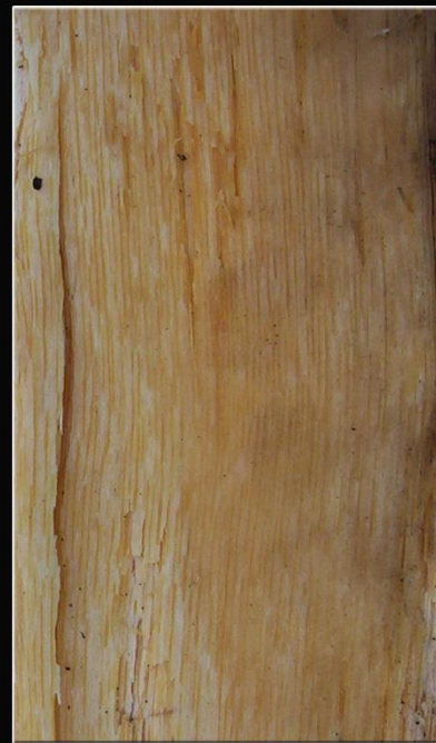
Inner surface of bark