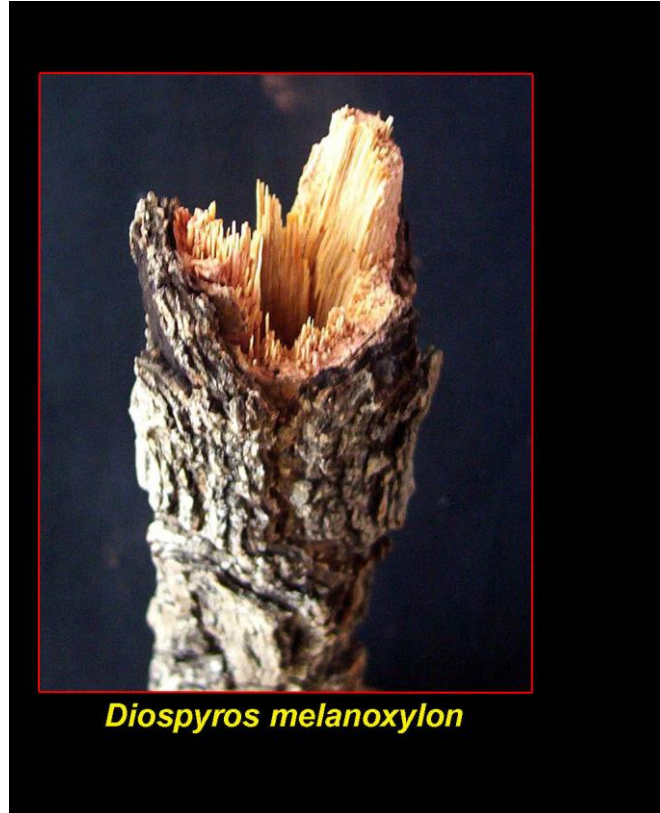
QUILLING OF BARK