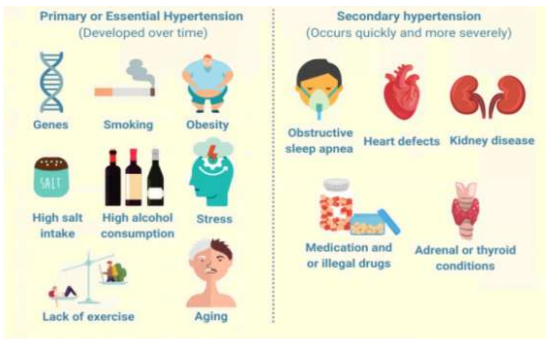
Figure 1: Causes of primary hypertension and secondary hypertension.