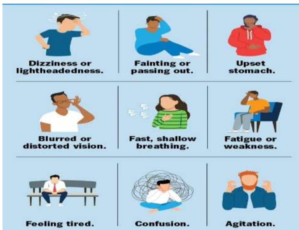
Figure 2: Symptoms of hypertension.