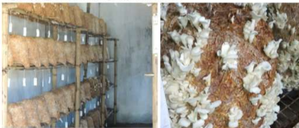
Fig: Cropping room and fruiting of oyster mushroom