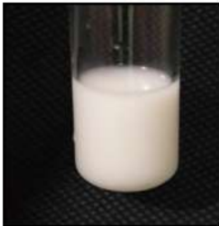
Fig No. 1 Solution prepared from Nanoeugenol

The nanoeugenol was dissolved with solvent Tween 80 in 1:1 ratio and dispersed in the aqueous phase (sterile distilled water) (10% solution). The resultant suspension of Nanoeugenol was turbid white in colour. The resultant suspension could be easily soluble in water for further dilutions of desired concentrations. The particle size was analyzed by particle size analyzer (Zeta Sizer). The Z-average of eugenol particles was found to be 97.65 nm and the resultant nanoeugenol was found to be 7.27 nm. The resultant had better water solubility and good stability of the solution. Considering the advantages of the nanoparticles in the durg delivery system, it can used as a very good antioxidant, anti-inflammatory, antimutagenic, antimicrobial, antiviral and anticancer drug.