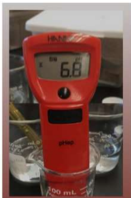
Figure No.3: PH meter

pH: Accurately weighed 5 g of the sample was dispersed in 45 ml. of water. The pH of the suspension was determined at 27°C using digital pH meter.