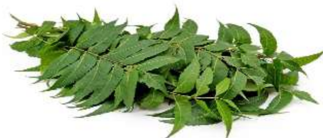
Figure No.1: Neem leaves

Neem leaves were collected from local areas of Bhiali. Extraction was done by using soxhlet apparatus and ethanol is used as a solvent for extraction process.