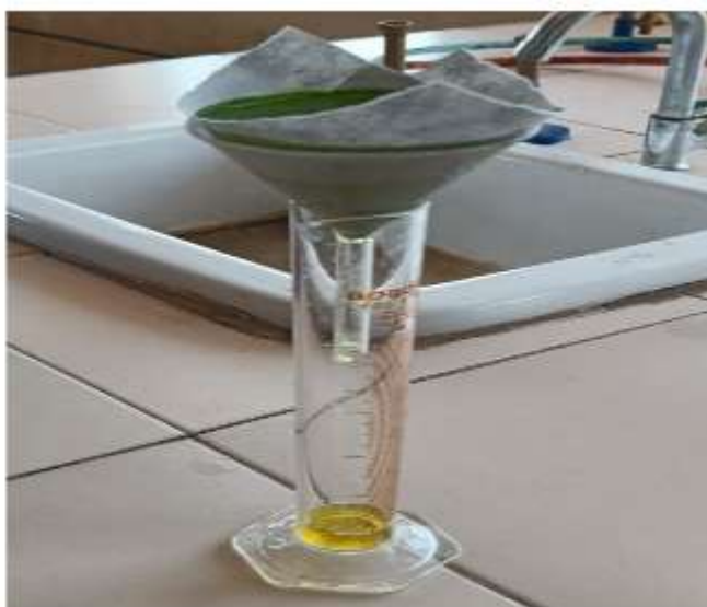
Figure No.2:-Filtration of Neem

manually all the leaves & dirt to be removed with blower air and heating of the seeds starts with hot air the temperature of the seeds.