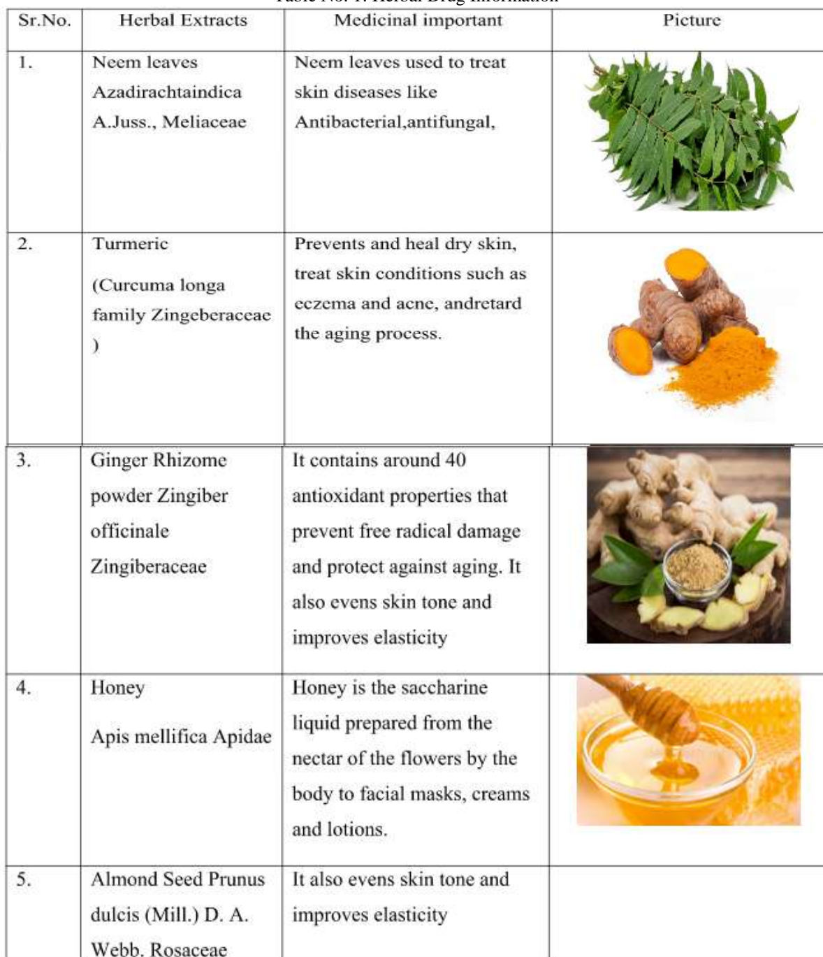
Table No. 1: Herbal Drug Information

Materials: All crude drugs were collected from Rungta institute of pharmaceutical sciences College of pharmacy Campus, Bhilai