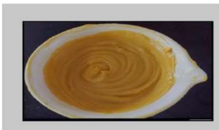
Figure No.4 :Formulation