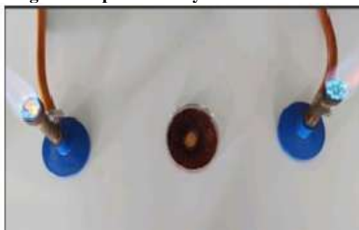
Fig 2: ZOI produced by Ointment formulation