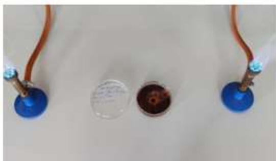
Fig 1: ZOI produced by Corn Silk extract