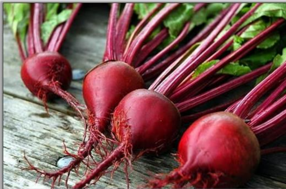
Fig no. 02 [3]