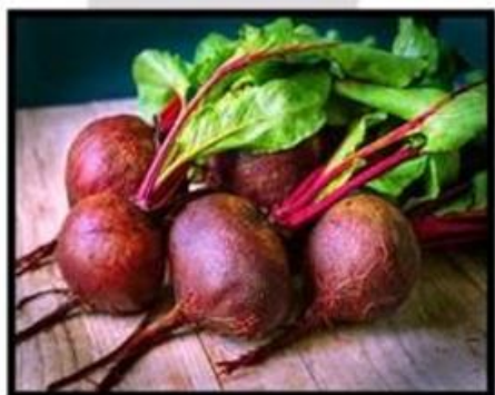
Fig. no. 07

The beetroot extracts present in the lip balm moisturize and hydrate your lips to restore balance and good health for your lips. Vitamin-E & essential oils present in the lips form a protective base for your lips to avoid damaged lips.