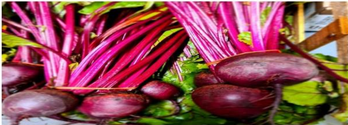
Fig no. 04

BARK : They improve blood structure which in turn improves the health of the circulatory system, digestive system and large intestine. Beetroots contain betaine, a compound that works together with choline (a B-complex vitamin also found in beets), to prevent build up of homocysteine levels in the blood.