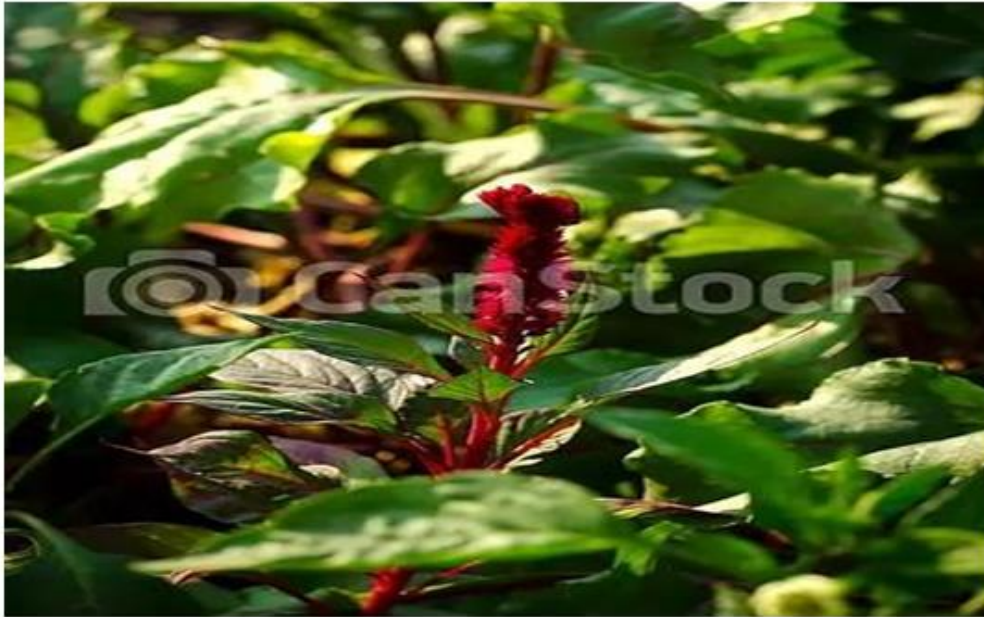
Fig no. 05