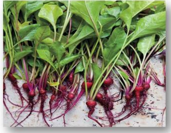
Fig no. 03

Beet greens are an excellent source of vitamin K, vitamin A (in the form of carotenoids), vitamin C, copper, potassium, manganese, vitamin B2, magnesium, vitamin E, fiber and calcium. They are a very good source of iron, vitamins B1, B6, and pantothenic acid, as well as phosphorus and protein.