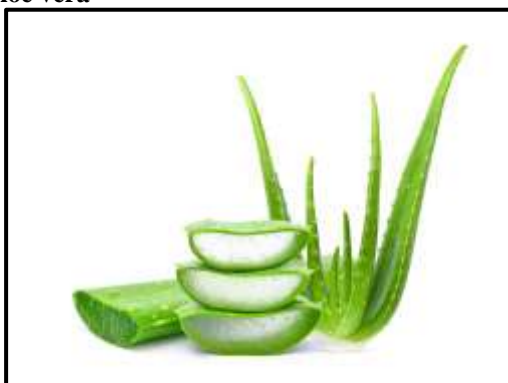
Fig. 3: Aloe vera.

The word aloe Vera means "aloe meaning shining bitter substance while "vera" means true. Aloe Vera contains vitamin A and C and it is also shows anti-inflammatory properties. Aloe Vera belongs to family "Liliaceae and commonly known as Ghritkumari. Aloe Vera used as moisturizing and softening agent on skin. The aloe gel gives cooling effect on skin it has role in rejuvenation of aging skin, Aloe Vera has been used for variety of medicinal purpose. Aloe Vera also be used as a moisturizer.