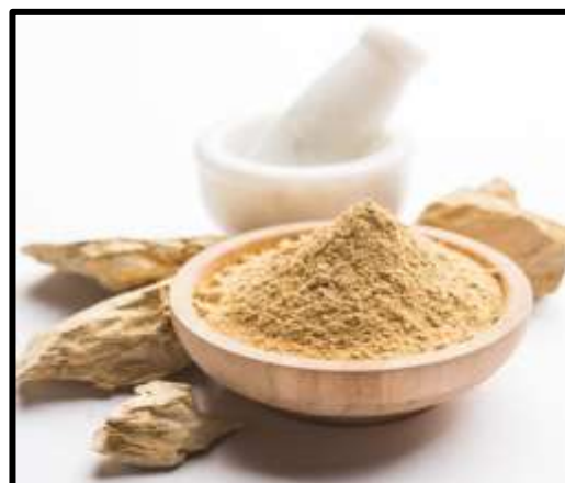
Fig. 6: Multani mitti

Multani mitti helps skin in different ways like minimise pore sizes, removing blackheads and whiteheads, cleansing skin, improving blood circulation, reducing acne and gives a glowing effect to a skin as they contain healthy nutrients. Multani mitti is rich magnesium chloride.