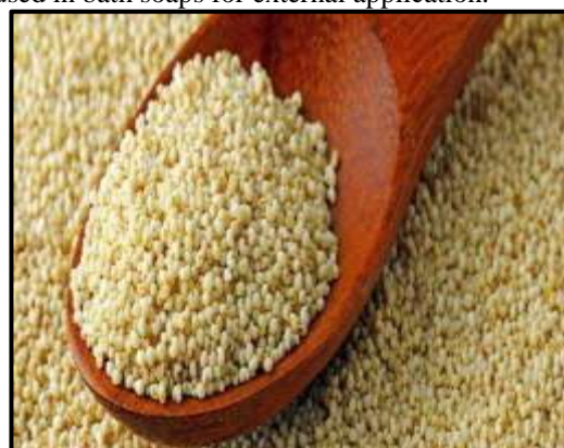
Fig. 7: KhusKhus

KhusKhus is an oilseed obtained from the poppy flower. Poppy seeds (KhusKhus) have strong anti-inflammatory ability, and thus actively used in Ayurvedic preparations for treating inflammation. This magical seed treats sleep disorders like insomnia. If insomnia occurs due to emotional issues such as anger or distress, these can also be treated with Khus Khus. It scores high on several accounts like dietary fibre, minerals (calcium and iron), vitamins, and omega-6 fatty acids. This herb has medicinal properties and thus used in bath soaps for external application.