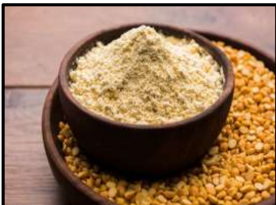
Fig. 6: Gram flour

Gram flour is good for acne-prone skin and can help to lighten any acne scars. It can also be applied all over the body to remove dark spots. It has been used as a base in preparation of herbal scrub.