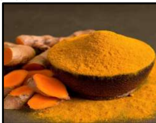
Fig. 4: Turmeric

Turmeric is mainly used to rejuvenate the skin. It delays the signs of aging like wrinkles and also possesses other properties like antibacterial, antiseptic and anti-inflammatory. It is effective in treatment of acne due to its antiseptic and antibacterial properties that fight pimples and provide a glow to your skin. It also reduces the oil secretion by the sebaceous glands. Turmeric widely