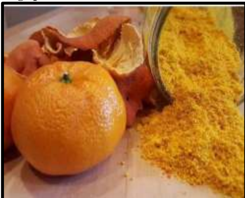
Fig. 5: Orange peels

Orange is a citrus fruit which contains different nutritional source like vitamin C. It also contain calcium, potassium and magnesium. It prevents the skin from free radical damage, skin hydration and oxidative stress. Also it has instant glow property, prevent acne, wrinkles and aging.