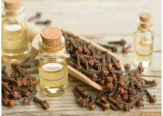
Fig-2 Clove oil

used as a flavouring for meats, stews, cakes and teas. Eugenol is also found in lower concentrations in cinnamon and other aromatic spices. Eugenol is the most abundant ingredient in clove oil and is thought to be responsible for its aromatic as well as both beneficial and harmful effects. In vitro, eugenol has been shown to have antibacterial, antifungal, antioxidant and antineoplastic activity.