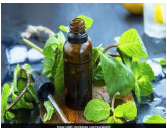
Fig-3 Mint oil

3.Mint oil: Peppermint oil is promoted for topical use (applied to the skin) for problems like headache, muscle aches, joint pain, and itching. In aromatherapy, peppermint oil is promoted for treating coughs and colds, reducing pain, improving mental function, and reducing stress. Both peppermint leaves and the essential oil from peppermint have been used for health purposes. Peppermint oil is the essential oil taken from the flowering parts and leaves of the peppermint plant. (Essential oils are very concentrated oils containing substances that give a plant its characteristic odour or flavour.). Peppermint is a common flavouring agent in foods and beverages, and peppermint oil is used as a fragrance in soaps and cosmetics.