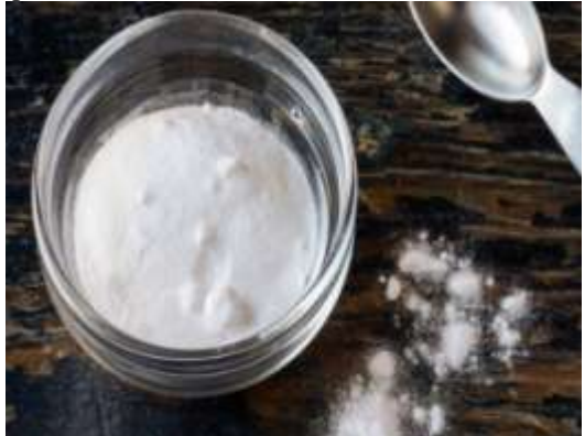
Fig-4 Sodium benzoate

4.Sodium Benzoate: Sodium benzoate also known as benzoate of soda is the sodium salt of benzoic acid, widely used as a food preservative (with an E number of E211) and a pickling agent. It appears as a white crystalline chemical with the formula C6H5COONa. Many foods are natural sources of benzoic acid, its salts, and its esters. Fruits and vegetables can be rich sources, particularly berries such as cranberry and bilberry. Other sources include seafood, such as prawns, and dairy products. Sodium benzoate is used as a treatment for urea cycle disorders due to its ability to bind amino acids. This leads to excretion of these amino acids and a decrease in ammonia levels. Recent research shows that sodium benzoate may be beneficial as an add on therapy (1 gram/day) in schizophrenia. Total Positive and Negative Syndrome Scale scores dropped by 21% compared to placebo.