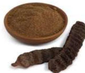
Fig No. 5- Shikakai

Shikakai contains Lupeol, Spinasterol, Lactone, Hexacosanol, Spinasterone, Calyctomine, Racimase – A Oleanolic acid, Lupenone, Betulin, Betulinic acid, Betulonic acid. The extract obtained from its pods is used as a hair cleanser and for the control of dandruff. Shikakai or acacia concinna, has rich amount of vitamin C, which is beneficial for hair. (14) Shikakai naturally lowers the pH value and retains the natural oils of the hair and keeps them lustrous and healthy. It is also effective in strengthening and conditioning hair. Amla, reetha and shikakai compliments each other, therefore, they are mixed together to have healthy and lustrous hair. All of these ingredients come in two forms, one as a dried fruit and other in powdered form. Amla, reetha, shikakai suit all hair types and helps prevent slit ends, hair fall, dandruff, greying of hairs and other hair related problems, to make hair soft and silky. (1)