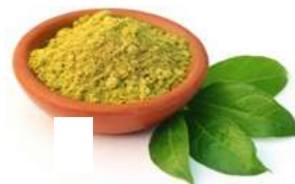
Fig No. 1- Heena

Chemical constituents:- flavonoids, gallic acid, lawsone, Carbohydrates, terpened, flavonoids.