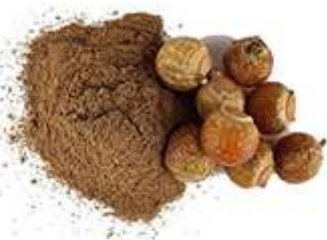
Fig No. 4- Reetha

Reetha fruit is rich in vitamin A, D, E, K, saponin, sugars, fatty acids and mucilage. Reetha extract is useful for the promotion of hair growth and reduced dandruff. (15) Extract of fruit coat acts as a natural shampoo, therefore is used in herbal shampoos in the form of hair cleanser Reetha as soapnuts or washing nuts, play an important role as natural hair care products since older times. This plant is enriched with saponins, which makes the hair healthy, shiny, and lustrous when used on regular basis. (1)