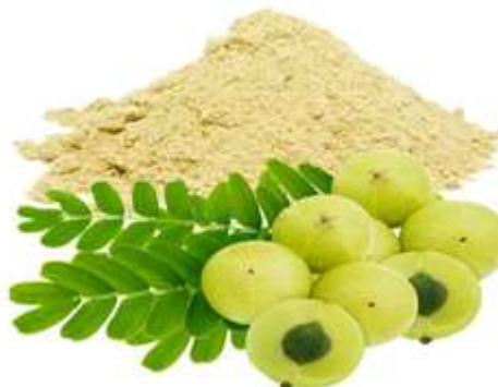
Fig No. 3- Amla

Amla improve the tone of hair dyes. It promotes healthy hair growth. It condition scalp. It minimize grays. It boost volume of hair. It treat dandruff and head lice. (6)