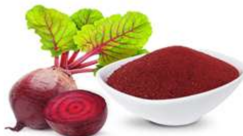
Fig No. 2- Beet Root

Beet root prevent air. It strengthen follicle's. Use to treat dandruff.