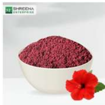
Fig No. 6- Hibiscus

It is rich in vitamins and antioxidants. (10)