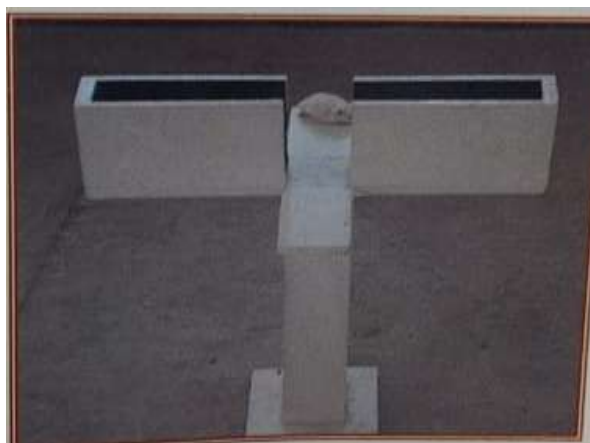
Elevated Plus Maze

protocols were approved by our Institutional animal ethical committee, which follows the guidelines of CPCSEA IAEC (Committee for the purpose of Control and Supervision of Experiments on Animals / Institutional Animal Ethics Committee), Reg. No. 918 / ac / 05 / CPCSEA. Anti-stress activity was determined by elevated plus maze method.[18,19] Mice (20–25g) were selected, weighed and divided into four groups of five animals each. Group 1 was kept as normal control, received drinking water, Group 2 was standard control, treated with 1 mg/kg of Alprazolam and remaining groups were treated orally with various extracts prepared using microwave and ultrasonication methods. After half-hour, the animals were kept in the centre of the maze, head facing towards open arm. Parameters like first preference of mouse towards open or closed arm were noted and number of entries in open and closed arm for five minutes was recorded.[20]