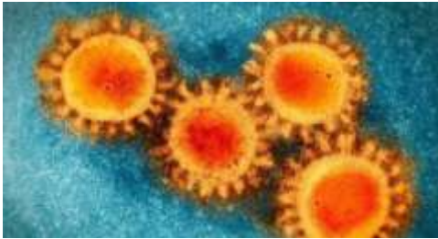
Fig: - Corona virus