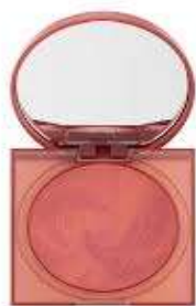
Figure 13: Compact blush powder

You can apply your blush as you would any other store bought powder blush, using a brush or a makeup sponge. Be sure to keep the lid on your container closed when you are not using the blush. The pictorial representation of compact blush powder is shown in figure 13.