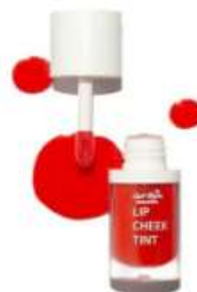
Figure 10: Cheek tint

The pictorial representation of cheek tint is shown in figure 10.