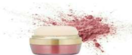
Figure 8: Loose powder blush

If you have sensitive skin, then you must save yourself the disdain by using a loose powder blush 17 . Mix two shades for a rosy luminosity or get creative by infusing a speck of bronzer or highlighter for a sun-kissed radiance. The pictorial representation of loose powder blush is shown in figure 8.