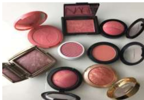
Figure 6: Different shades of compact blush powder

Different shades of compact blush are available in market. They are peppermint candy, mimosa, peach, strawberry, mauvette, pretty naked, healthy, berry, pink plum, cherry, plum, and chiffon 15 . The pictorial representation of different shades of compact blush powder is shown in figure 6.