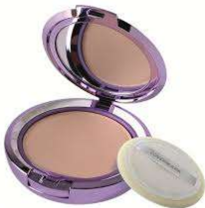
Figure 2: Compact blush powder

The pictorial representation of compact powder blush, loose powder blush and cream blush are shown in the figure 2, figure 3, figure 4 respectively.