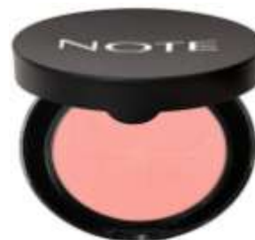
Figure 7: Compact blush

If you have fair skin, remember less is more to own a healthy flush. Select shades in pale pink or baby pink for a subtle glow 16 . The pictorial representation of compact blush is shown in figure 7.