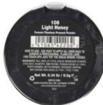
Figure 14: Label of compact blush powder

Label of a compact blush powder was shown in figure 14.