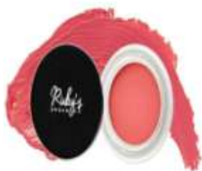
Figure 9: Cream blush

If you are looking for something organic and extremely long-lasting, then this blush is your savior. They will glide on effortlessly, feel weightless on your cheeks and will give you a natural dewiness 18 . To work your blush-first face, this and the tip of your ring finger is all you need. Cream blush works on all kinds of skin types and across all age ranges. But it's especially perfect for dry or more mature skin which always needs that extra bit of moisture. The one skin type that might have issues with cream blush is very oily skins, powder formula makeup will always be the better option. The pictorial representation of cream blush is shown in figure 9.