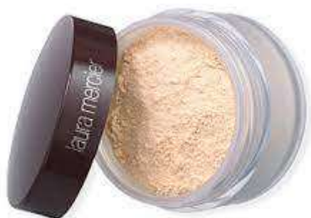
Figure 3: Loose powder