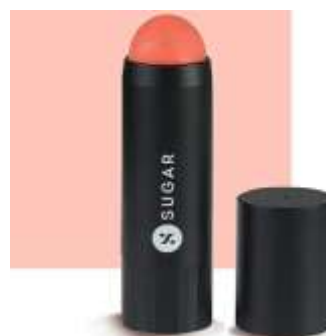
Figure 11: Blush stick

This cream-based stick is meant for on-the-go convenience. You can simply carry it around in your bag or makeup pouch. It's seamless in application and can be blended with a brush or fingers. The pictorial representation of blush stick is shown in figure 11.