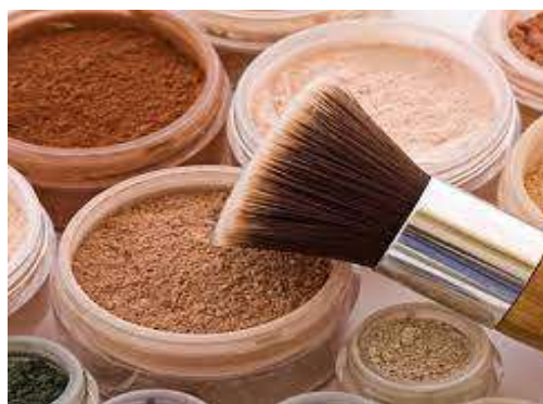
Figure 1: Different types of face powder

Powders are products that are intended to change the appearance of facial skin. They typically work by applying colour to the skin or through other effects such as altering the reflection of light or the shininess of the skin. Different types of powders used as cosmetics are foundation powder, blushing powder, H D powder, mineral powder, talcum powder, finishing powder, translucent powder, dewy powder, colour correcting powders etc 4 . The pictorial representation different types of face powders are shown in figure 1.