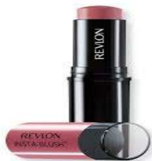
Figure 4: Cream blush