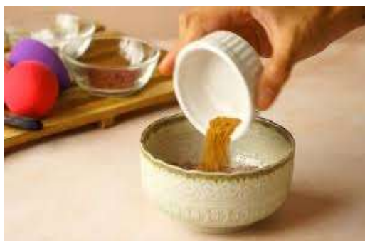
Figure12: Preparation of compact blush powder