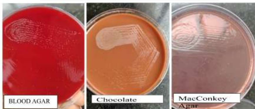
FIGURE: 2: 2

Direct microscopy shows intracellular Gram negative diplococci