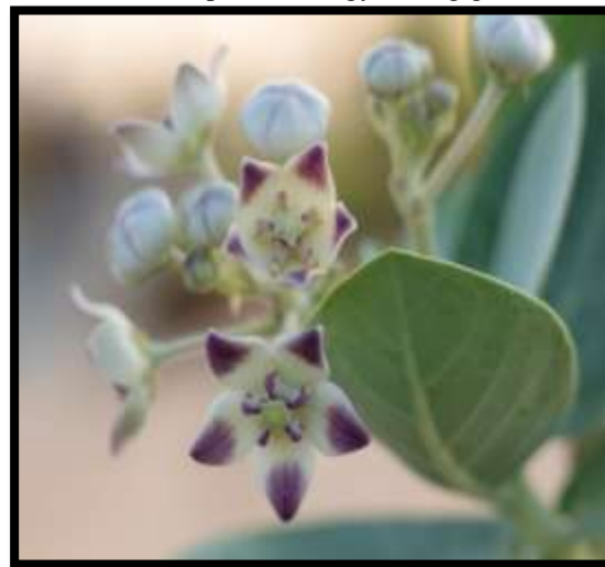
Fig .1: Calotropis Gigantea plant [15].

Medicinal plants are major source of the traditional medicine in India. India is considered as “Botanical Garden of World”. A large segment of Indian population use medicinal plants for their health security. India has 15 agroclimatic zones and 17000-18000 species of flowering plants of which 6000-7000 are estimated to have medicinal usage in traditional systems of medicines (Anonymous, 2015). The Medicinal and Aromatic Plants contain a large number of chemical constituents which are the major source of therapeutic agents to cure human discomfort. The World Health Organization has also recognized the role of traditional systems of medicine, which depend largely upon the medicinal plants. The use of Medicinal and Aromatic Plants throughout the world has been increasing by the rate of 7-15 % annually. Calotropis gigantea (L.) Dry and is one of such plants, which has long tradition of use in various systems of medicine. Thus, a review has been compiled on ethnopharmacological uses, chemical constituents and pharmacology of C. gigantea [4]