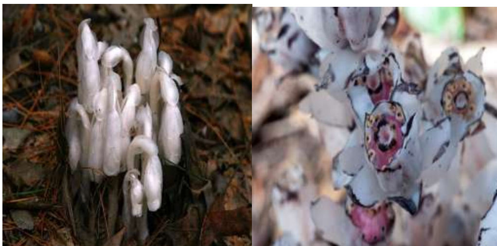
Figure 3: Monotropa uniflora (Arielle the plant humorist)