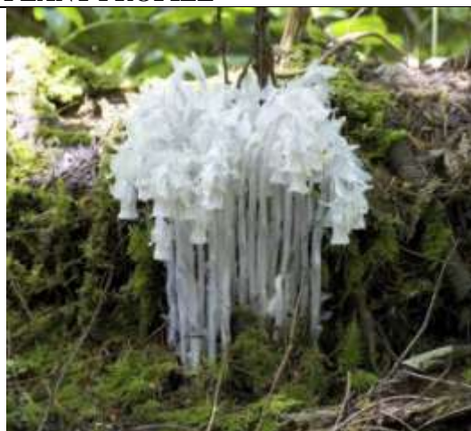
Whole plant Monotropa uniflora (Arielle the plant humorist)

Kingdom: Plantae (unranked): Angiosperms (unranked): Eudicots (unranked): Asterids Subkingdom: Viridiplantae Infrakingdom: Streptophyta Division: Tracheophyta Superdivision: Embryophyta Subdivision: Spermatophytina Class: Magnoliopsida Order: Ericales Superorder: Asteranae Family: Ericaceae Genus: Monotropa Species: uniflora(10).