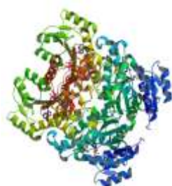
Fig 1: Enoyl reductase E.coli (1C14)