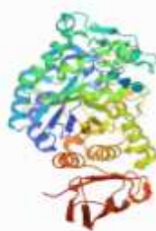
Fig 2: Alpha amylase (1UA7)