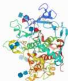
Fig 3: Tyrosinase (3NM8)