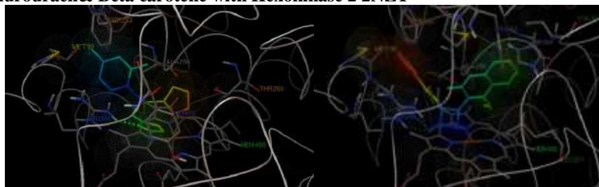
Fig 11. 5-Fluorouracil with 2NZT