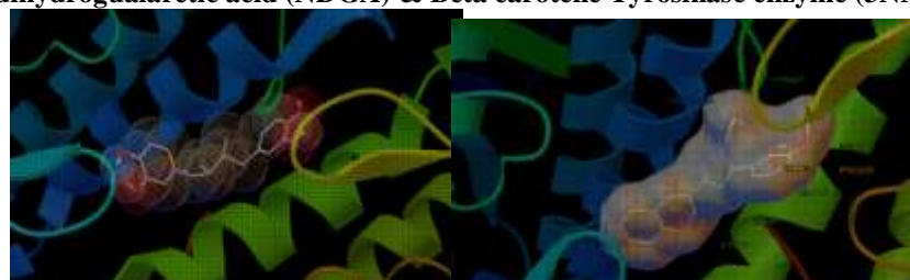
Fig 9. NDGA binding with 3NM8