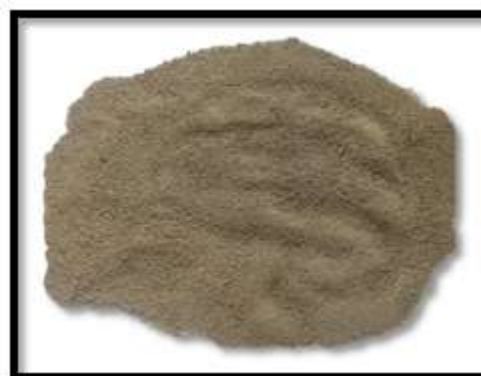
Fig – 7 Lubrication