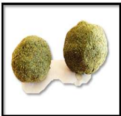
Fig –3 Mix with starch and herbs