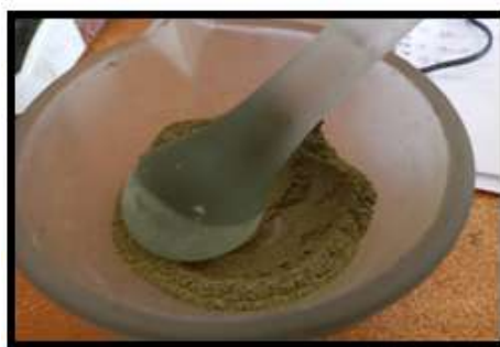
Fig - 1 Mix of Herbs Powder