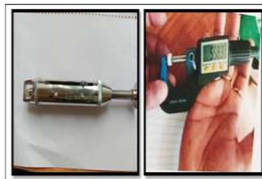
Fig – 10 Monsanto & Vernier Calipers

For each formulation, the hardness and thickness of 20 tablets were demarcated. Hardness test was determined by Monsanto hardness tester and the thickness of tablets was determined by Vernier Calipers.