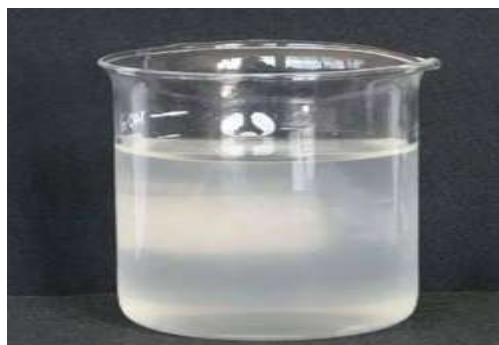
Fig – 2 Starch Solution