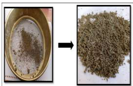
Fig – 4 Sieving