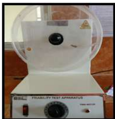
Fig – 11 Friability test Apparatus

Frangibility of a tablets can determine in a laboratory by Roche friabilator. The friabilator consists of plastic chamber that rotates at 25rpm, dropping the tablets through a distance of six elevation in the friabilator, which is also operated for 100 revolutions. The tablets are revisited. Squeeze tablets loss lower than 0.5 to 1.0 of the tablet cargo are considered respectable.