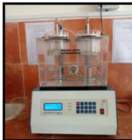
Fig – 12 Disintegration test Apparatus

This test was a time required for the tablet to separate into particles, the disintegration test measure only of the time required under a given set of a conditions for a group of tablets to disintegrate into particles. This test was performed to identify the disintegration of tablet in a specific time period.