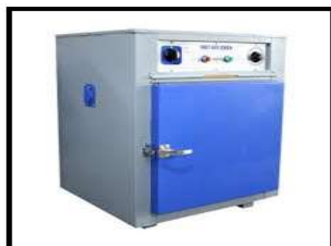
Fig – 5 Hot Air Oven