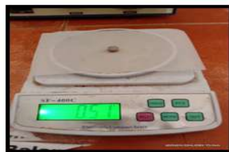
Fig – 9 Weight of tablet