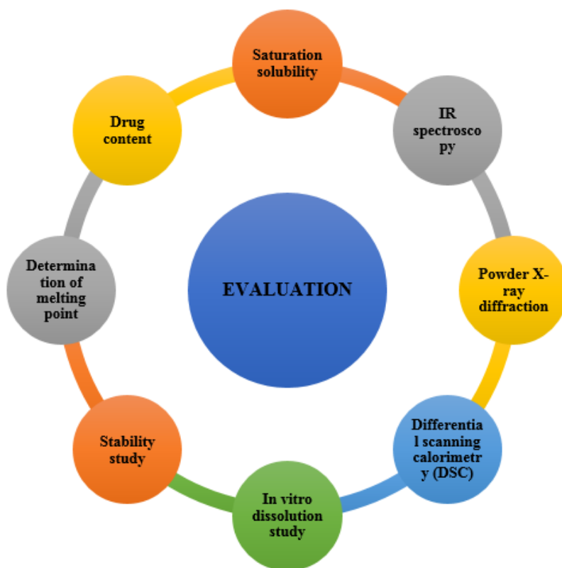
Fig no 4: Evaluation of cocrystal