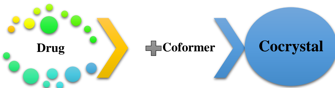
Fig no 2: Cocrystals