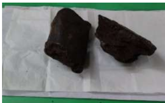
Figure 1: - Bee Propolis (Apis Mellifera) in India

As per estimates of National Bee Board (NBB), [85] India has the potential to maintain about 200 million bee colonies which can create employment for over 6 million rural and tribal families. [2] India has all types of honey bees, which includes Apis Dorsata (giant honey bee), Apis Cerana Indica (Indian honey bee), Apis Florea (dwarf honey bee), Apis Mellifera (European honey bee). From this Apis Mellifera is not native to India and was launched from the year 1983 in