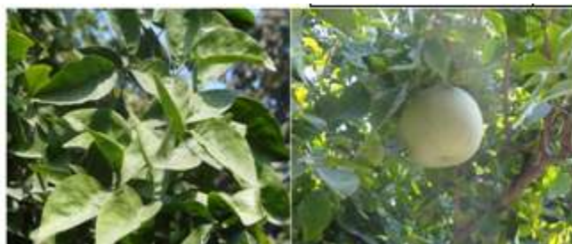
Fig .Leaves and fruits of Aegle marmelos