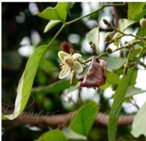
Fig flower of Aegle marmelos

Fruit: After diarrhea, fruit is consumed to aid in the healing process. Work well as a dysentery treatment and for mild astringency. The South Chhattisgarh traditional healers employ dry Fruit powder mixed with mustard oil to cure burns instances. Two parts mustard oil and one part powder are combined and used externally.