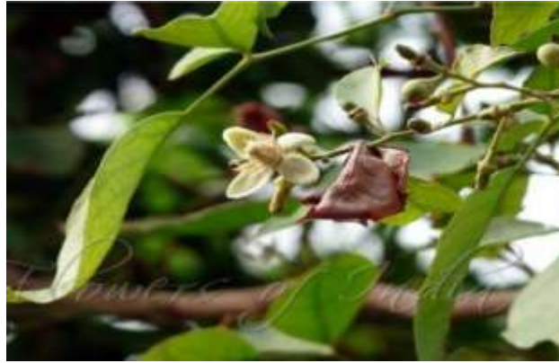
Fig . Aegle marmelos leaves