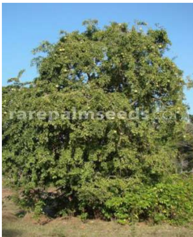
Fig 1 . Plant of Aegle marmelos