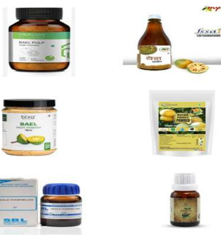
Some Of The Marketed Products Formulations Of Aegle Marmelos.