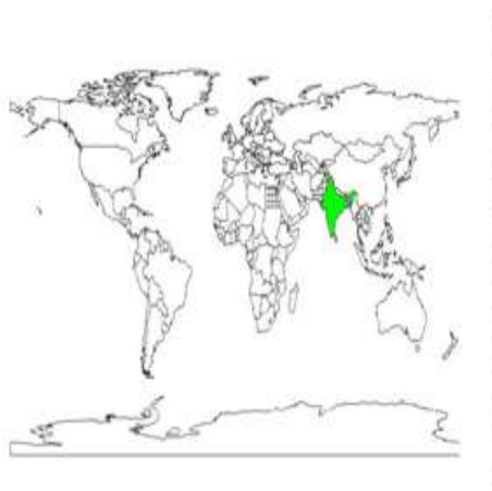
Fig. Native Range.

The tree thrives with little fertilizer and irrigation and doesn't require strict cultural conditions. trees vegetatively propagated in years, with a spacing of 6–9 years in orchards. When it turns yellowish-green, the entire crop is harvested and stored for eight days to allow the green hue to fade.