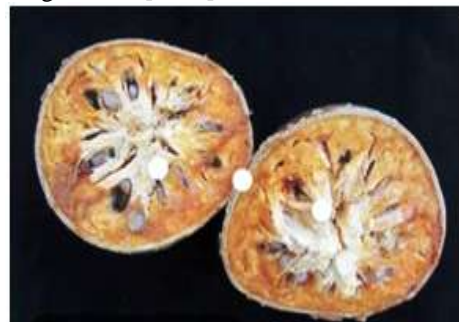
Fig. ripe fruit of aegle marmelos

Stomach discomfort. Fresh fruit juice has a strong, bitter flavor. the extract reduces blood sugar levels.[3847]