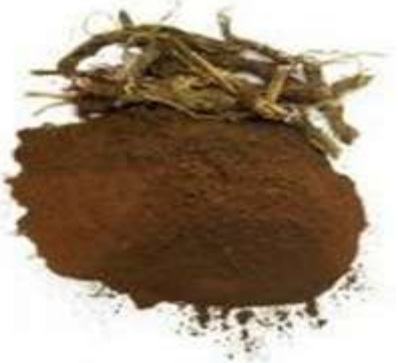
Fig roots of Aegle marmelos

for appetite loss. and puerperal illnesses, such as irritation of the uterus.[41]