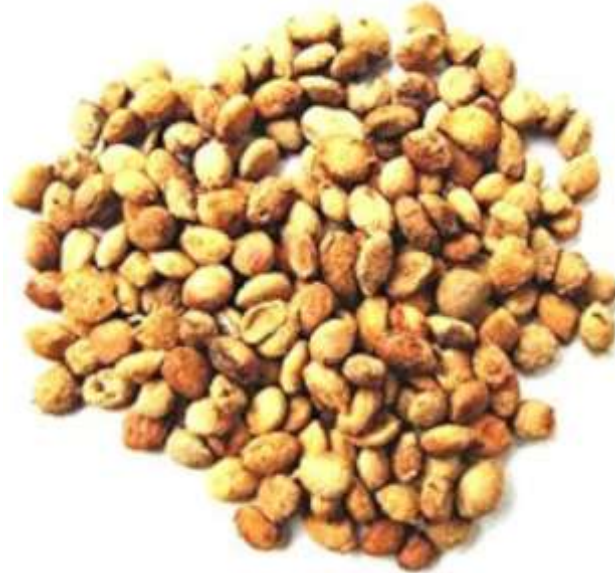
Fig : Aegle marmelos seeds