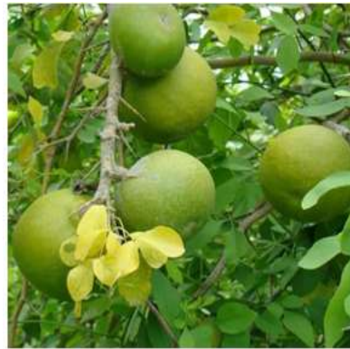
Fig . fruits of aegle marmelos